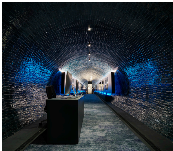
Archea Associati, Rifugio Digitale, Florence, 2022